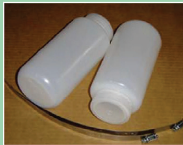
Standard Operation Float Kit (6682)